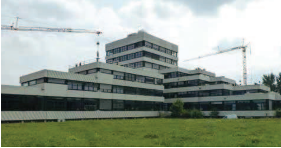
University of Applied Sciences in Lemgo