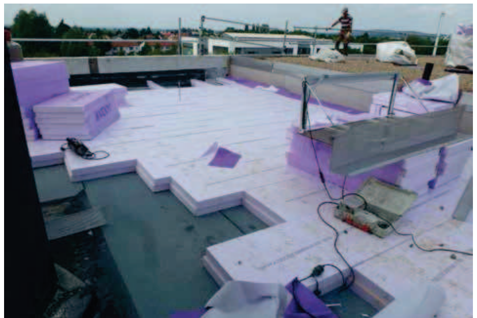
Inverted roof insulation with JACKODUR Plus for University of Applied Sciences in Lemgo

Hence the company's search for a gas blowing agent (GBA) that would help improve on Lambda levels of 34-37 mW/(m-K) using CO 2 (JACKODUR KF) or HFC-152a (JACKODUR CFR). XPS produced using HFC-134a exhibited better thermal conductivity (29-31 mW/(mK)) but at a high global warming potential (GWP) of 1,300*1.